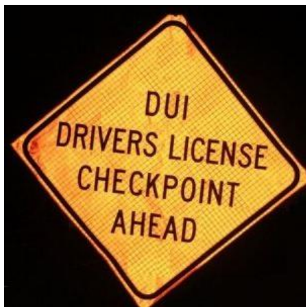
Abolish Policing DUI Checkpoint

Kropotkin spells it out, but it bears restating for reinforcement. The law is a few things most of us recognize as bad and would not otherwise do. Then come along the political class to pile on a mass of victimless code violations to generate revenue. Then come the jack-booted thugs to enforce them.